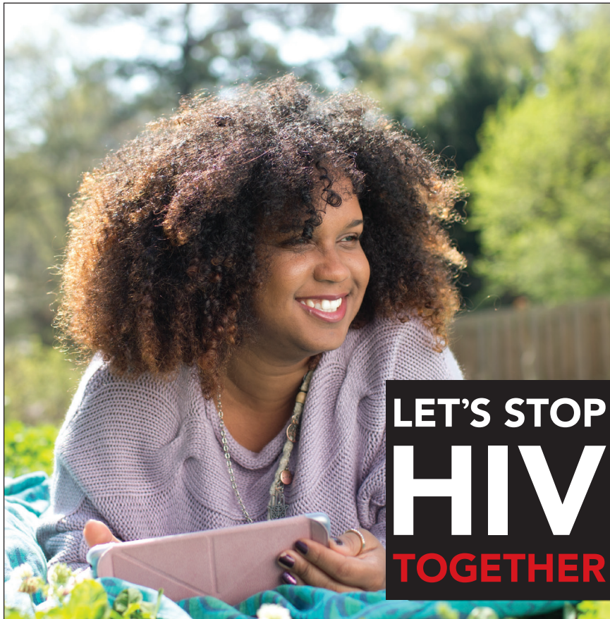
Funding for this publication was provided by the Illinois Department of Public Health Center for Minority Health Services.

Without proper treatment, HIV may lead to serious complications, AIDS, and other illnesses. By following your treatment regimen with the assistance of ADAP-MAP, you can improve your health and reduce the chances of transmitting HIV to someone else.