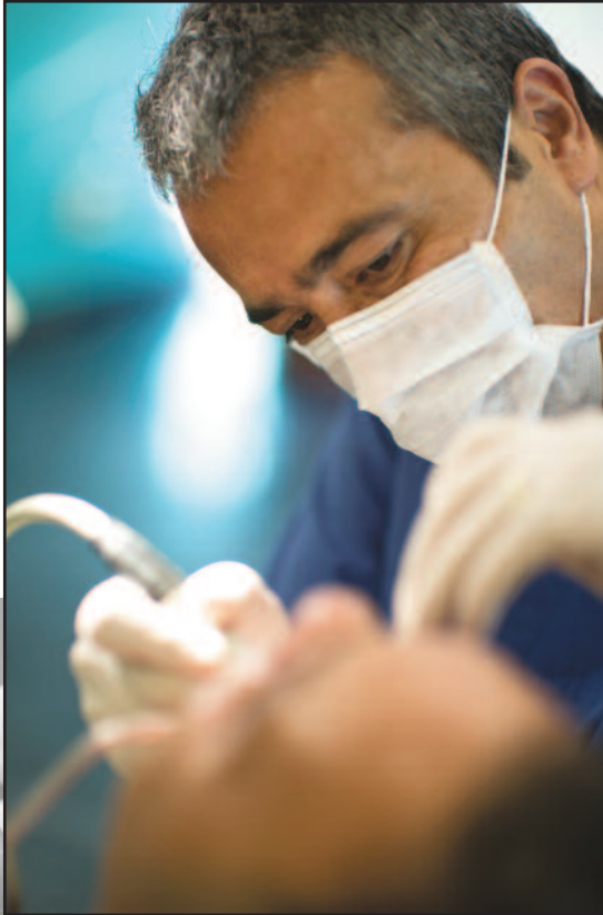
Photos are used for illustrative purposes only and all persons depicted are models.

Go to www.hivcareconnect.com today to learn more